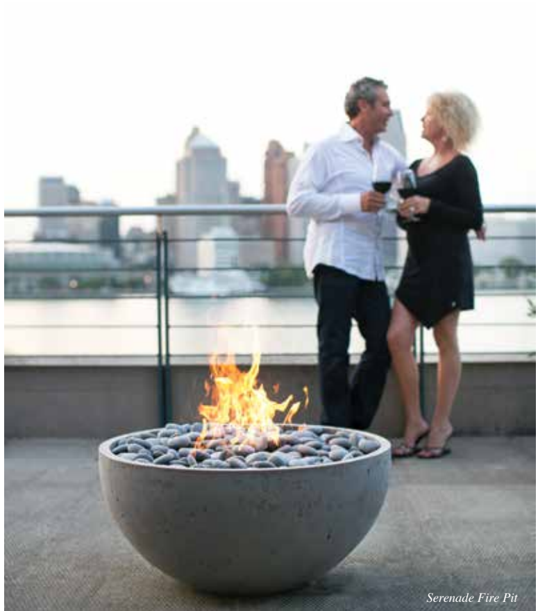
Serenade Fire Pit