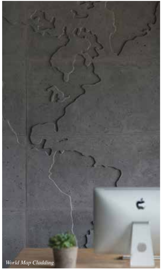
World Map Cladding