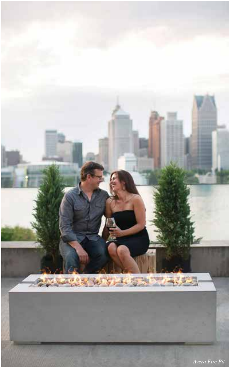
Avera Fire Pit