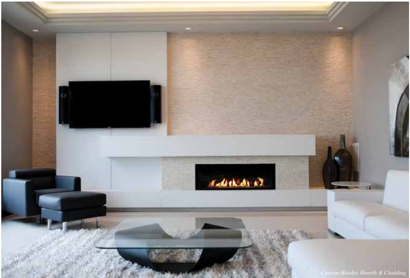
Custom Header, Hearth & Cladding