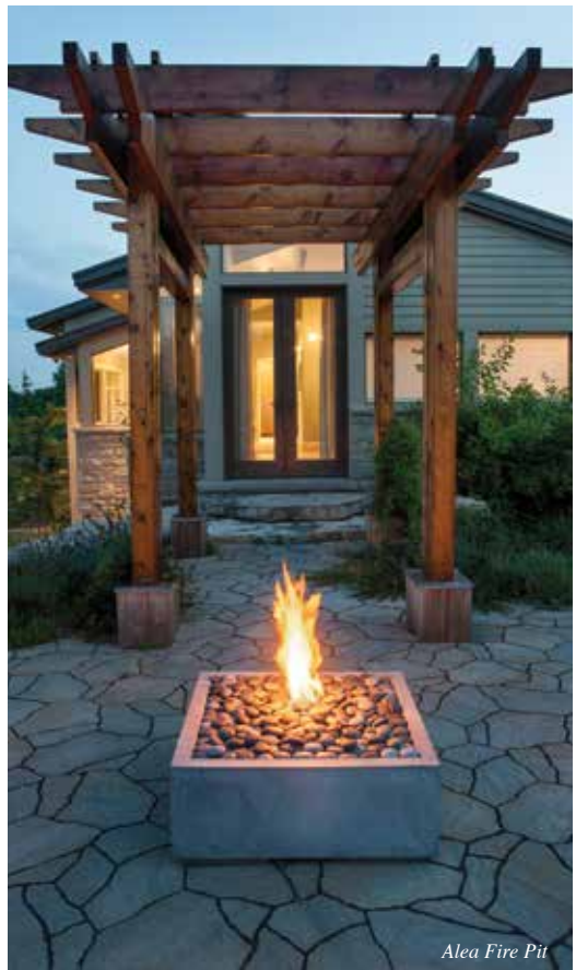
Alea Fire Pit