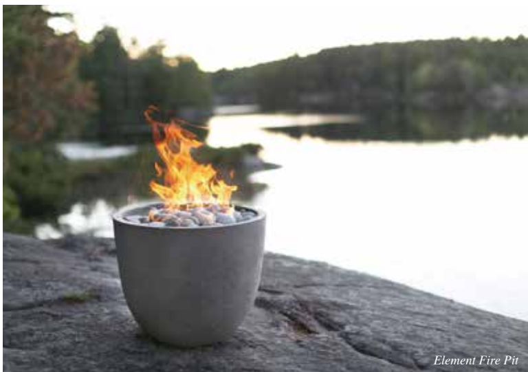
Element Fire Pit